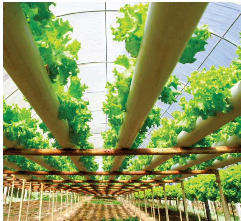
Hydroponic farming practice.

Decision will be made known to successful applicants following field verification.